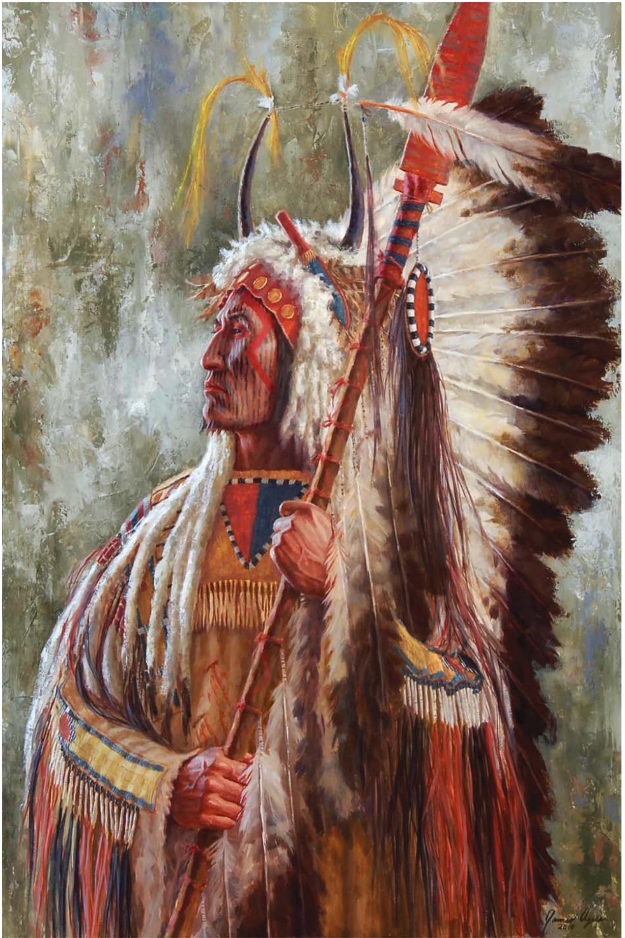
Mato-Tope, Four Bears , oil, 36 x 24"