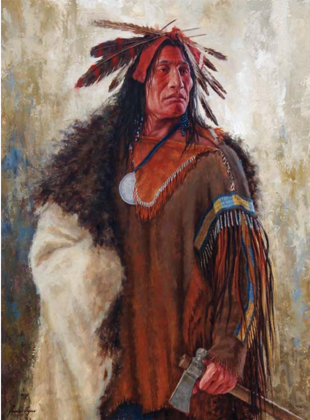
Wahktageli, Gallant Warrior, oil, 32 x 24"