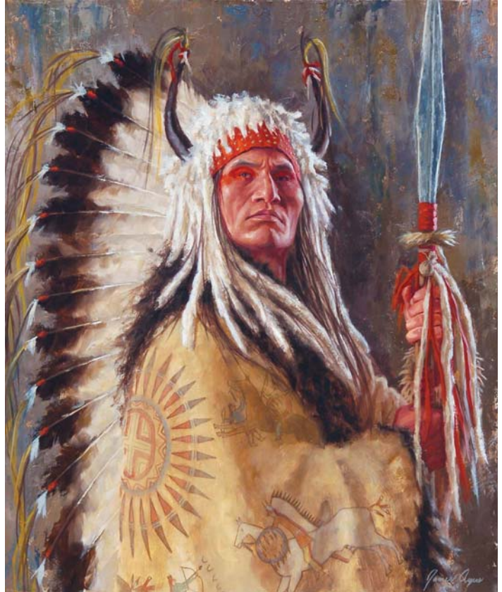
Black Rock, oil, 24 x 20"