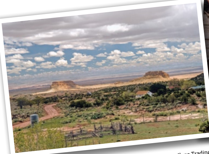
Views from the austere but breathtaking region of the historic Toadlena Trading Post, home of Navajo weavers who create some of the most sought-after textiles on the market today.

Wopila Artist Guild hosts its first exhibit honoring the Navajo weavers of historic Toadlena Trading Post.