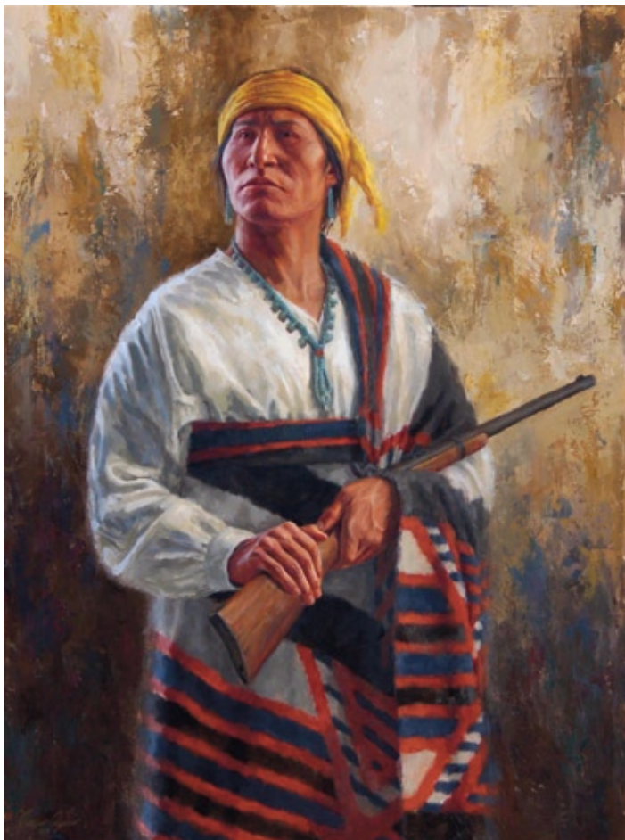
James Ayers , Navajo Finery , oil on board, 32 x 24" In Navajo Finery , Ayers portrays a proud Navajo man from the 1870s wearing a classic third phase chief's blanket.