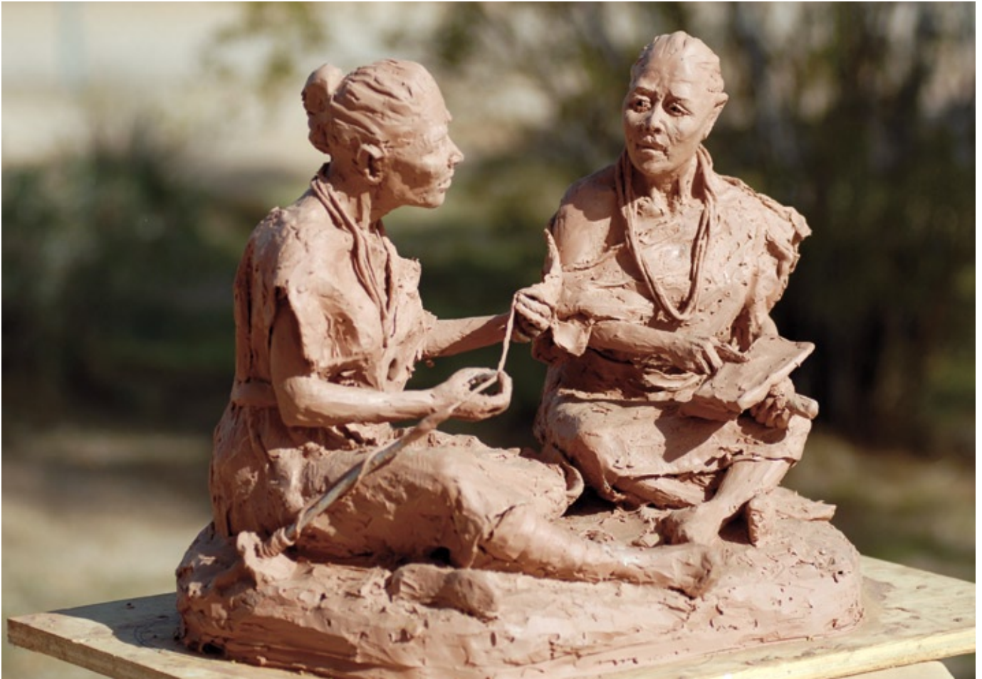
Craig Bergsgaard , The Lesson , clay, 20 x 24 x 16"