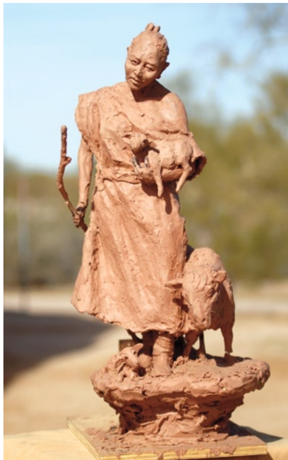
Craig Bergsgaard , The Chaperone , clay, 32 x 14 x 14" The Chaperone features a Navajo woman tending to the young sheep of her flock. The shepherdess is wearing the traditional blanket dress and bun hairstyle of 150 years ago.

components of complexity, composition and beauty, the end product is truly a work of art."